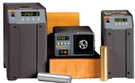
Fluke 9103 DryWell Calibrator