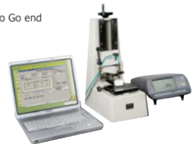
Slip Gauge Calibrator